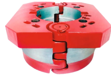
Master Bushing for Oilwell RT Model: ADTMB 3750-SQ Figure No. 2