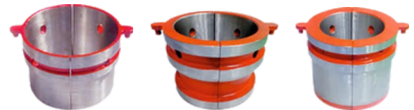
Insert Bowl No. 1 Insert Bowl No. 2 Insert Bowl No. 3 (Suitable for above all three models of Master Bushing) Figure No. 3